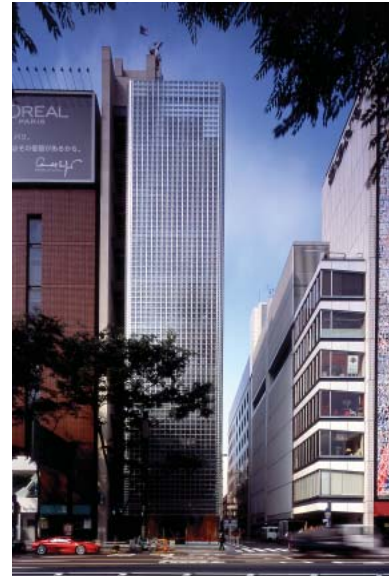
RENZO PIANO BUILDING WORKSHOP